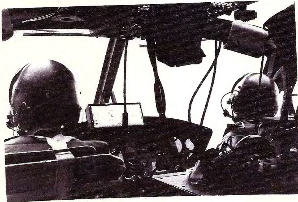
The cockpit of OUTLAW- 1.

By 1968 the Army had abandoned its use of the DECCA system. Attached are a couple pictures of the DECCA system in Outlaw 1.